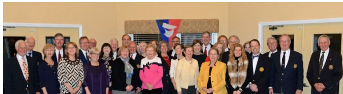
Past Commodores and Spouses/Guests